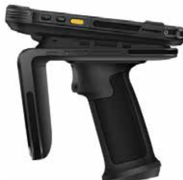
UHF Sled Reader